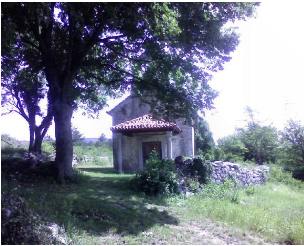
Church near Skocjan, Slovenia

The chimney begs to be cleaned, so she reaches up and scrapes with her fingernails. The doornails beg to be driven in, but she doesn't have the strength to lift the hammer, so she bangs with a canning jar until it shatters on the floor. I find her scraping up the pieces of glass with papers from my desk, and my neck is stiff as a headstone. If she read my book of blades, she alone might feel its dullness.