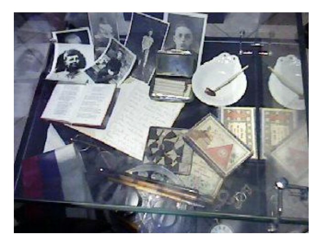
from Kosovel's House, Tomaj, Slovenia

The moonlight is cold as ice cream. Empty as the troubadour's song. It's nice to sit in the shade of the night. Latrines. Pissoir. Here. A man behind the door, what does he want? Shadow-like he stands behind the transparent door of moonlight. Moonlight covers the fields like a petrified sickness... Your body glistens in the moonlight.