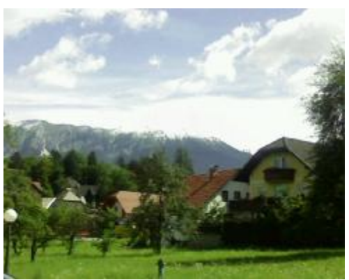
Karst Village near Kosovel's House

What is wealth? What's luxury? For me it is this: a small coat I have, and this coat is like no other.