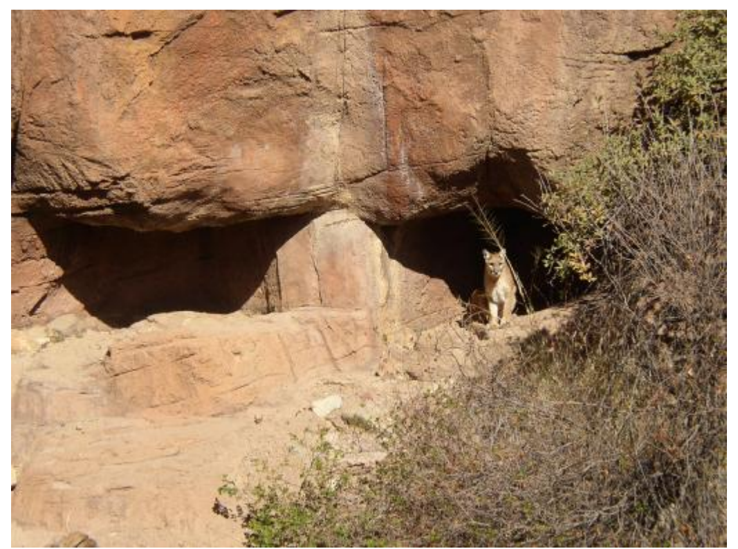
Near Tucson Arizona

My grandson knows, after six years of living, that even one unexpected animal crossing your path means you have chosen the right trail. He is as certain as morning dew, shaken from a blanket of stars, that he can talk to the owls. Sitting as crossed legged as his boot laces, listening to their low pitched stutter, he informs no one in particular that he can do this owl talk. To him the empty socket of the sinkhole is not some earth betrayed by rock, but a pocket to be emptied, a cupped hand of earthen talismans, fat glossy buckeyes, slate smooth as snake skin, that fill his pockets of imagination. But most of all he knows, the monsters he invents, living deep in a cave's heart, churning like black clouds, must have a way out. He tells me about tunnels, as secret as silence, where evil will travel. It is here we must stand guard,