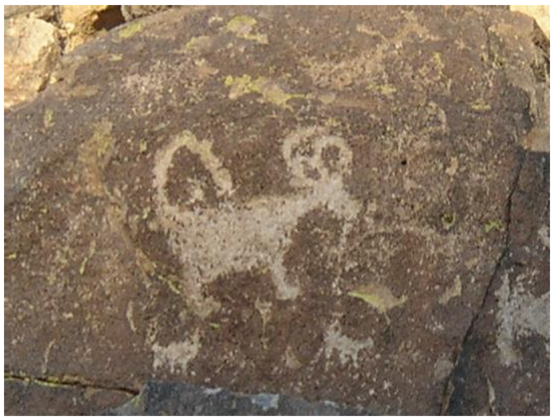
Rock Painting, Near Tucson, AZ