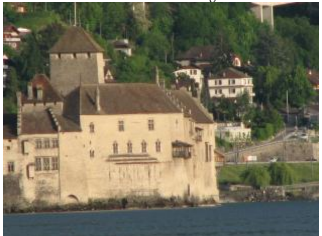
Castle of Chillon