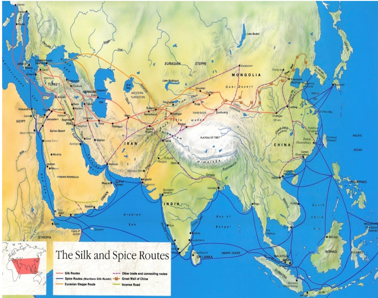
Figure 2: The silk and spice routes