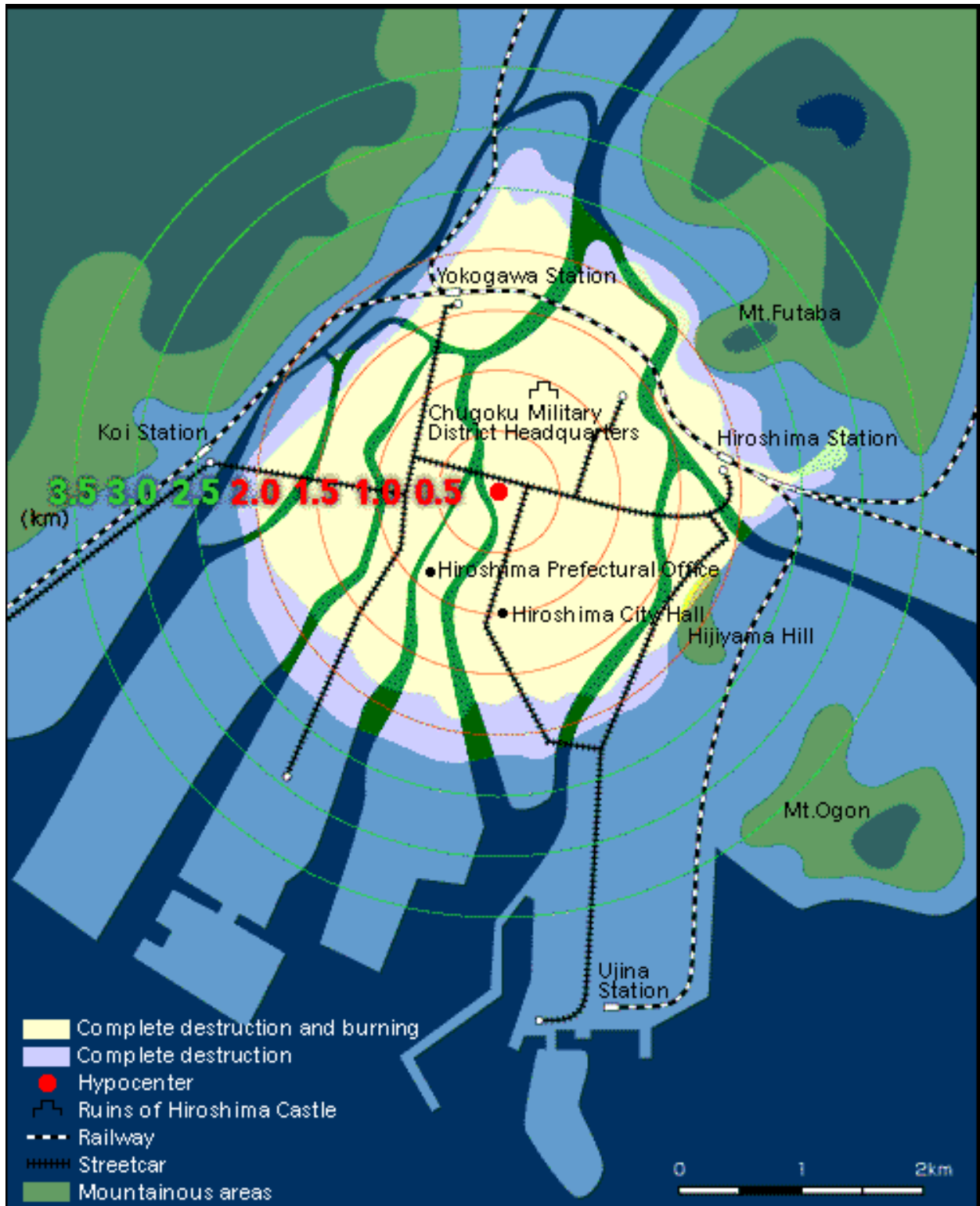
Figure 2 - Map Credit: Hiroshima Peace Site

By contrast, Nagasaki had virtually no buildings located directly under the hypocenter of the bomb, but studies of resultant blast damage patterns have indicated that the bomb dropped on