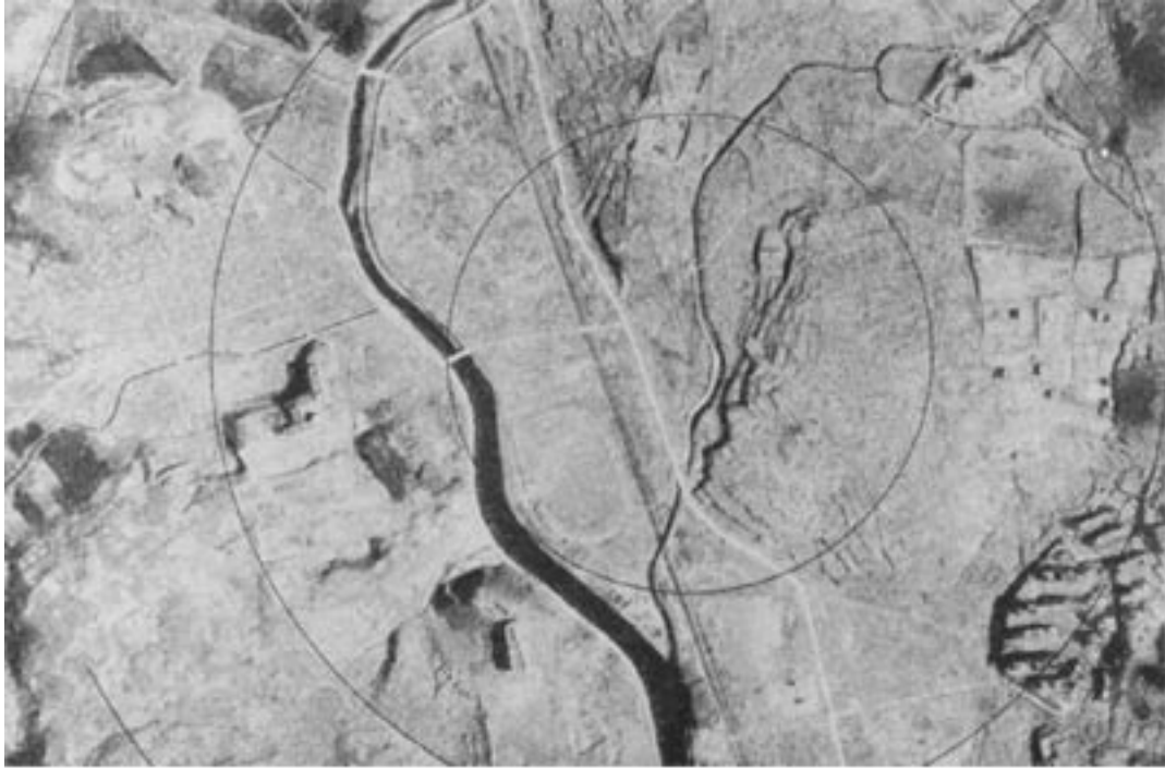
Aerial view of Nagasaki after nuclear attack [36]

Figure 4 - Photo Credit: Rain of Ruin: The Atomic Decision Website