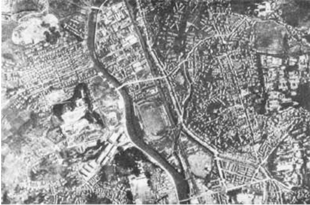
Aerial view of Nagasaki before the nuclear attack [36]

Nagasaki was much more effective than the one dropped on Hiroshima and the radius of damage was larger in Nagasaki than in Hiroshima (The Avalon Project). Figures 3 and 4 are aerial photographs of Nagasaki before and after the bomb was dropped. The level of destruction is unmistakable.