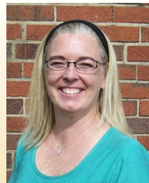
Meet UTC's Newest Advisor