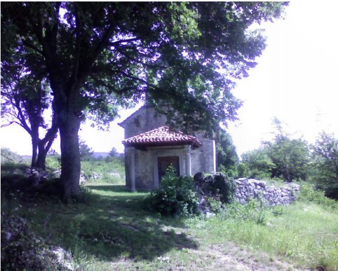
Church near Skočjan, Slovenia

The chimney begs to be cleaned, so she reaches up and scrapes with her fingernails. The doornails beg to be driven in, but she doesn't have the strength to lift the hammer, so she bangs with a canning jar until it shatters on the floor. I find her scraping up the pieces of glass with papers from my desk, and my neck is stiff as a headstone. If she read my book of blades, she alone might feel its dullness.