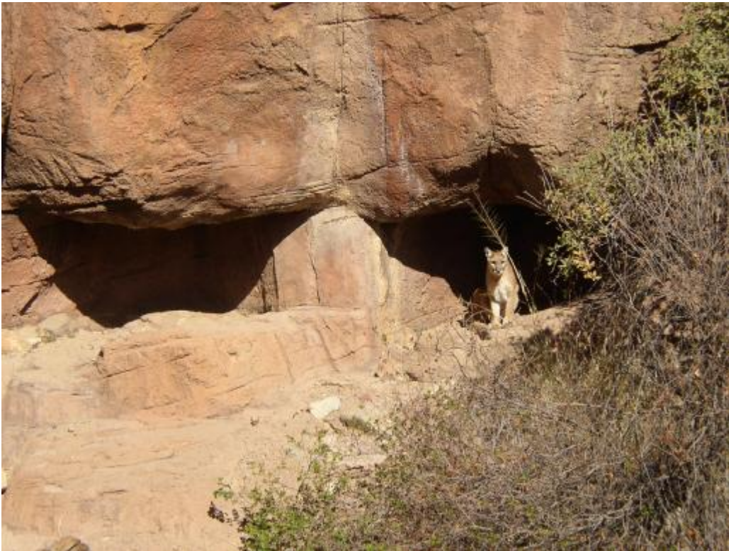
Near Tucson Arizona

My grandson knows, after six years of living, that even one unexpected animal crossing your path means you have chosen the right trail. He is as certain as morning dew, shaken from a blanket of stars, that he can talk to the owls. Sitting as crossed legged as his boot laces, listening to their low pitched stutter, he informs no one in particular that he can do this owl talk. To him the empty socket of the sinkhole is not some earth betrayed by rock, but a pocket to be emptied, a cupped hand of earthen talismans, fat glossy buckeyes, slate smooth as snake skin, that fill his pockets of imagination. But most of all he knows, the monsters he invents, living deep in a cave's heart, churning like black clouds, must have a way out. He tells me about tunnels, as secret as silence, where evil will travel. It is here we must stand guard,