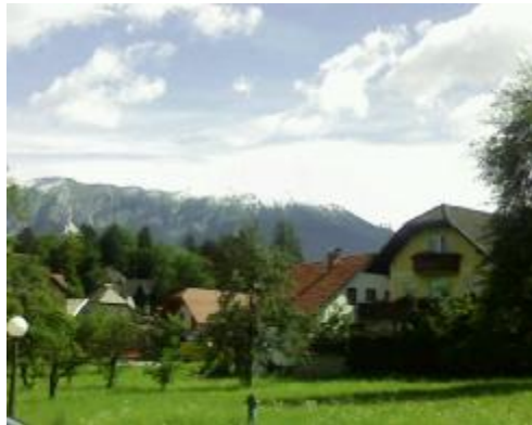
Karst Village near Kosovel's House

What is wealth? What's luxury? For me it is this: a small coat I have, and this coat is like no other.