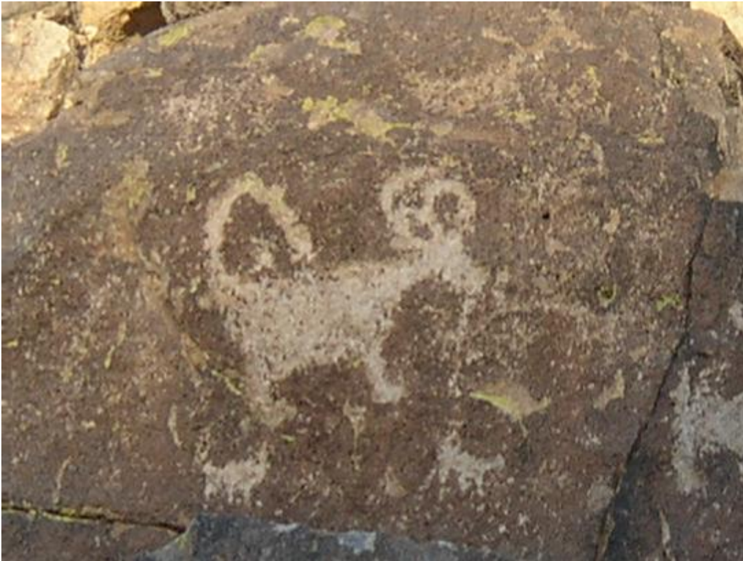
Rock Painting, Near Tucson, AZ