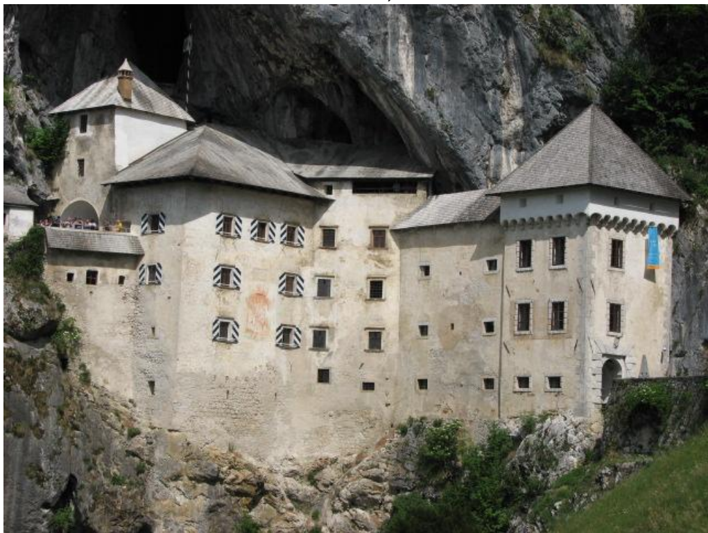
Predjamski Grad, Slovenia