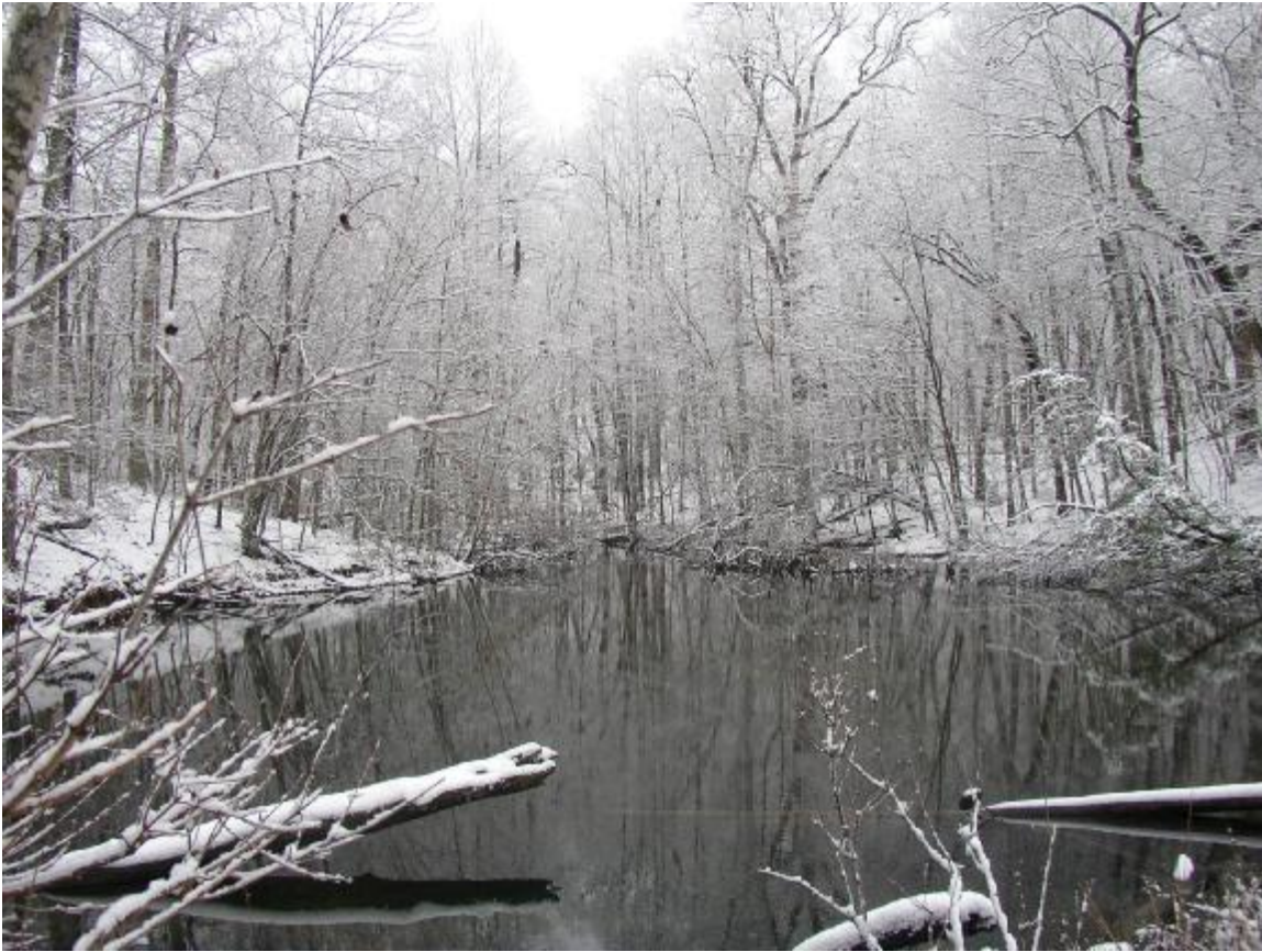
Near Fall Creek Falls, TN

and carrying a weapon through the neighborhood. Turns out it was only an air gun. Bomb 'em all , he yelled as they threw him to the grass, cuffed him and drove away. Can you imagine? Please speak English. A few of us speak Spanish, but official policy states we must speak the Official Language. What's that? America doesn't have an Official Language? Not according to Policy. Keep in line. Hands to yourself. Avoid eye contact. Step out of line only if directed. Declare everything. You have nothing to hide. Keep away from the pandas.