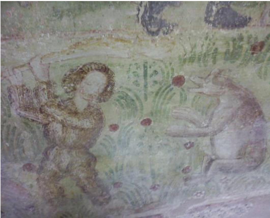
Church Fresco, Near Skocjan, Slovenia