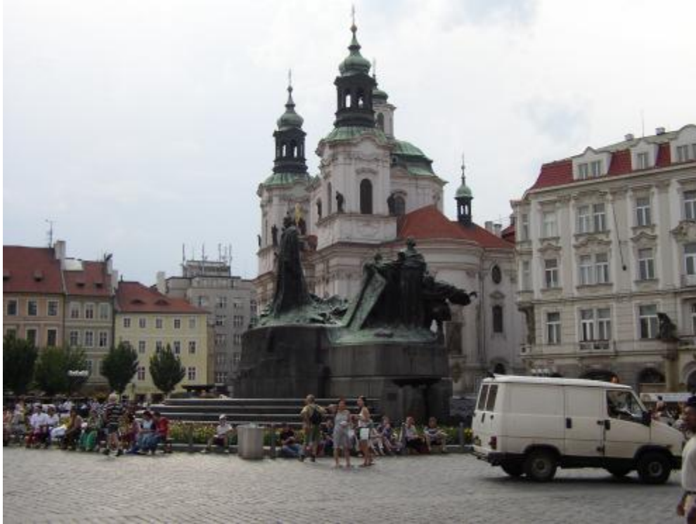
Jan Hus Monument, Prague