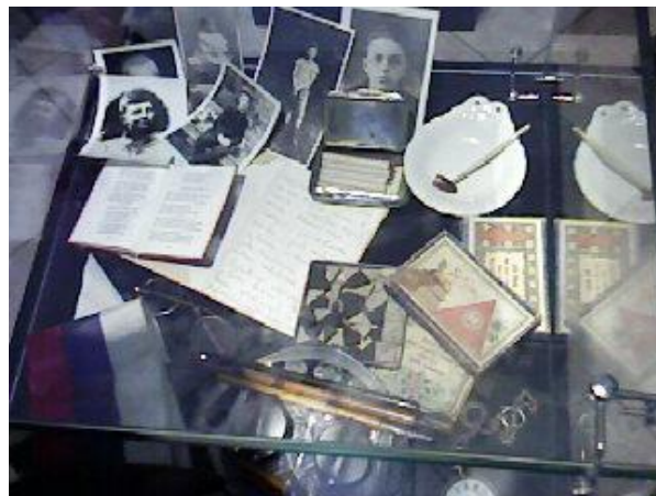
from Kosovel's House, Tomaj, Slovenia

The moonlight is cold as ice cream. Empty as the troubadour's song. It's nice to sit in the shade of the night. Latrines. Pissoir. Here. A man behind the door, what does he want? Shadow-like he stands behind the transparent door of moonlight. Moonlight covers the fields like a petrified sickness... Your body glistens in the moonlight.