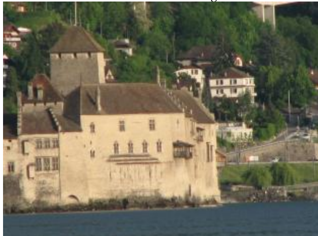
Castle of Chillon