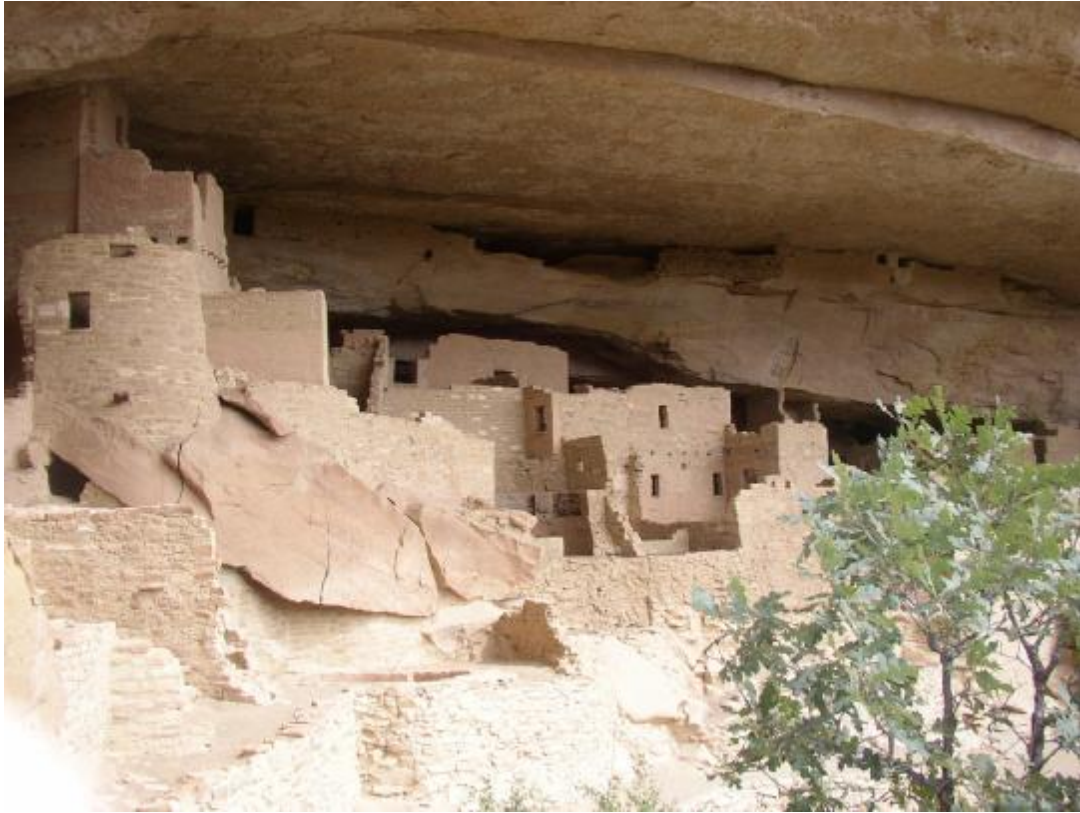
Mesa Verde, CO