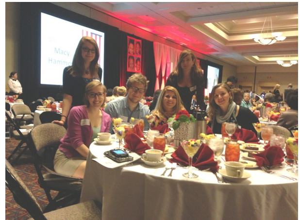
Women's Studies Faculty and Students